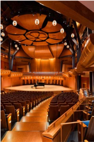
Inside the Bella Concert Hall.

The opening of the Taylor Centre for the Performing Arts at Mount Royal University marks the emergence of a music facility that is a first in Calgary in terms of size and amenities and is also unique to university music education in Canada.