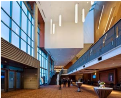
Lobby view.

Located on the school's Lincoln Park Campus, the Taylor Centre is part of a six phase expansion program that started in 2001 to meet the needs of increasing student enrollment. Mount Royal University currently has a student population of more than 14,000 full and part time credit students.