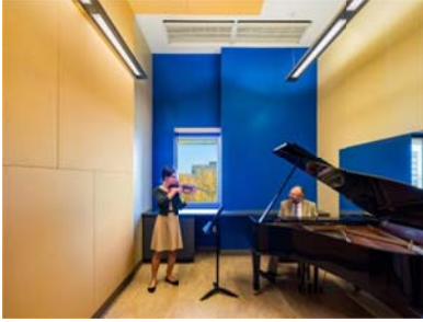
The Centre includes many practice and rehearsal spaces for professional and community program.

The new facility uses advanced technology in electrical, heating, and cooling systems which help with the acoustic isolation of the individual rooms and studios offering users the ability to learn, practice, and rehearse undisturbed.