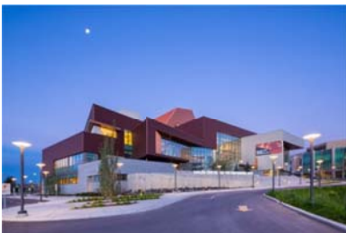
View of the Taylor Centre at Mount Royal University.

The opening of the Taylor Centre for the Performing Arts at Mount Royal University marks the emergence of a music facility that is a first in Calgary in terms of size and amenities and is also unique to university music education in Canada.