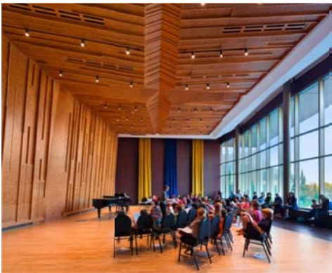
A multi-purpose hall uses a similar wood cladding to the main concert hall.

At the centre of the new building is the 773-seat Bella Concert Hall. The design of the concert hall is a modern deconstruction of a rural barn reflecting Alberta's prairie heritage and landscape; the ceiling design is inspired by a prairie rose. The Bella Concert Hall will be used for a variety of music styles from traditional orchestras, choirs, piano soloists to jazz and popular music—both acoustic and amplified. To achieve the needed acoustic flexibility, more than 9,800 square feet of deployable banners and panels were integrated into the hall's walls and ceiling.