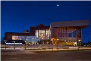
Exterior of the Taylor Centre at night.

The new facility uses advanced technology in electrical, heating, and cooling systems which help with the acoustic isolation of the individual rooms and studios offering users the ability to learn, practice, and rehearse undisturbed.